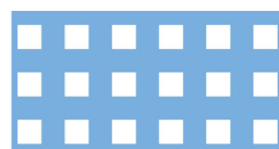
Astraios-S straight line